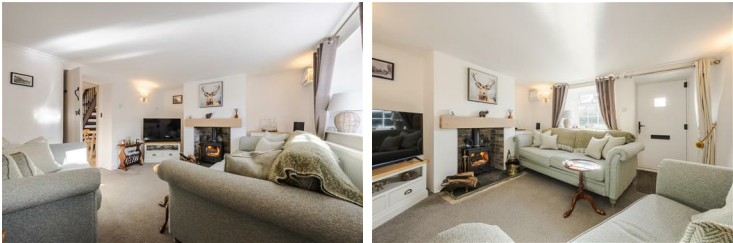
Lounge 14'3" x 11'5" (4.36 x 3.50)