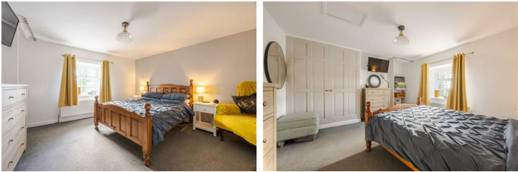
Bedroom two 10'7" x 10'3" (3.25 x 3.13)